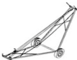
HST-10T + tires