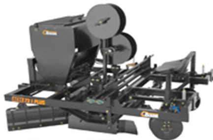
ACOL-72+ Combo + FVH-300 Fertilizer