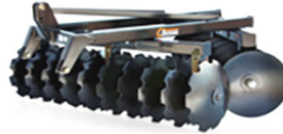
RIB-2022 Offset Disc