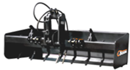
BB210 Construction Box Scraper