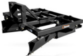
TF-3248 Bed Shaper