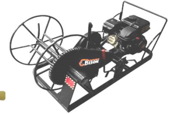
WR Wire Roller