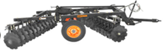
RT Offset Disc