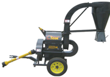
MMRB-20 Feed Hammer Mill