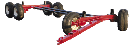
RS125T 12-Ton Tandem + Tires