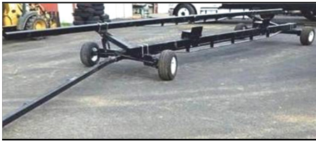
RS70HC Header Trailer + Tires