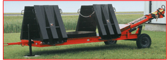
Driveover Pit, Transport