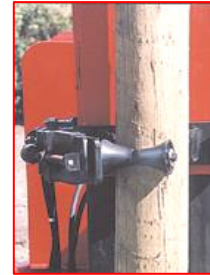
Hydr Post Hugger