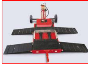
Driveover Pit, In Use