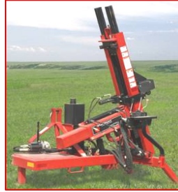
Offset Mast, 3-Point