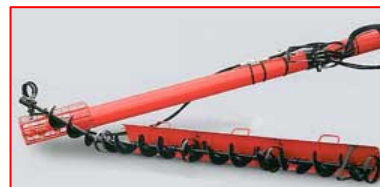
Auger Sweep + Ext