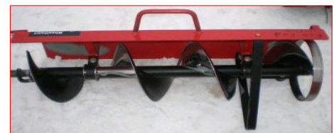
30" Extension w/Shoe