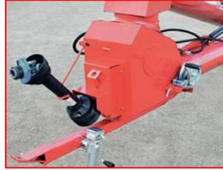
CV-PTO Direct Drive