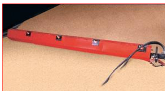
In-Bin Sweep + Ext