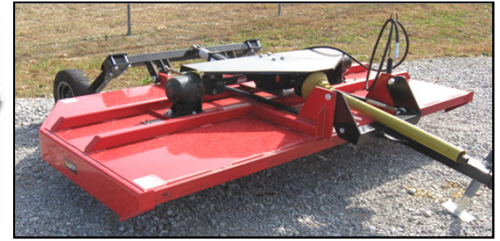
Heavy Pull-Type Cutter