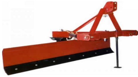
Tilt/Offset Rear Blade

TENNESSEE RIVER Blades, Scrapers, Rakes July 1, 2020-C FOB Decatur TN Specially priced for stocking dealers.