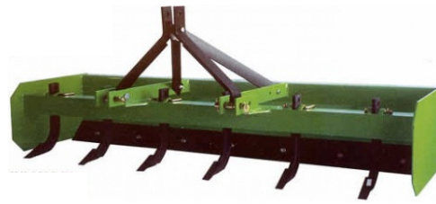
HD Box Scraper