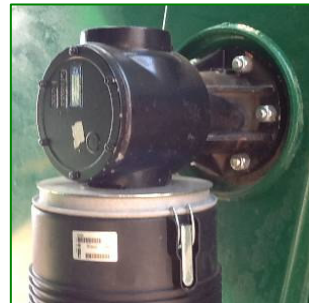
Bondioli Gearboxes & Drives