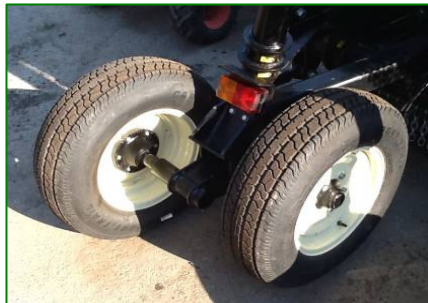
U.S. Hubs, Wheels, Tires