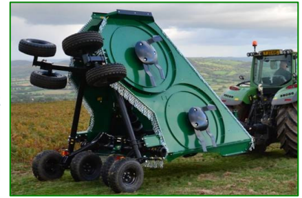
Compact 8'6" Transport Width