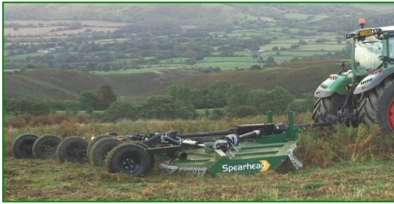
Model 827 27' 5-Rotor Cutter