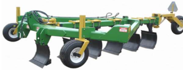
6306 On-Land Plow