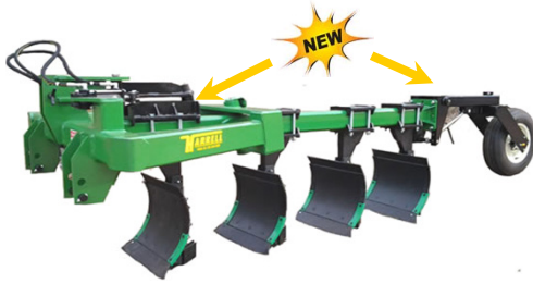
NEW! 9400-Series In-Furrow Plows