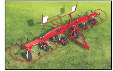
Hay Tedders 10' to 24'