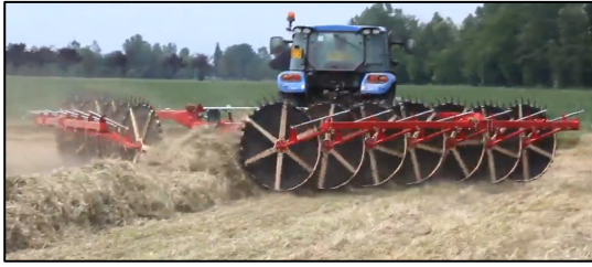
Maximus Rake - High Clearance, Dual Springs