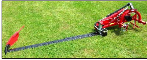
Sickle Bar Mowers, 5' to 9'