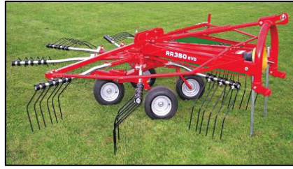
Rotary Rakes 10'6" Single to 25'7" Twin