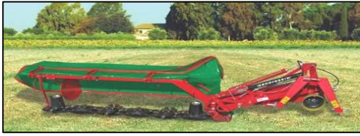
Disc Mowers, 5'6" to 9'2"