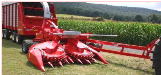
F61 120" Head on Dion