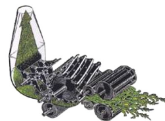
Straight-Thru Crop Flow