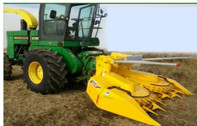
F63 120" 4-Row Head on John Deere