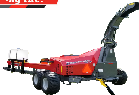
Model 300 with Standard Spout