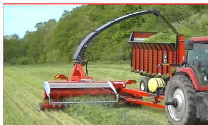
"Stinger" Harvester + 9' Hay Head