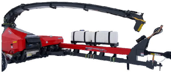
Model 300 w/Folding Stinger Spout & Tank