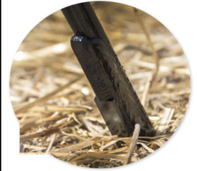
Carbide Wear Tips