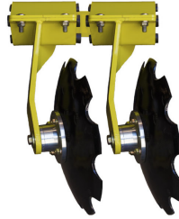
Fully Independent Discs