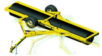
20-Foot Land Roller