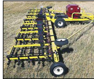
Strawmaster Heavy Harrow