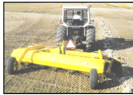
RR1500 Rock Rake