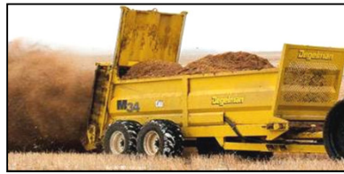
M34 Manure Spreader