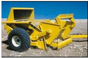
7200HD Rock Picker

Ellis Equipment is your Degelman sales rep, not a distributor. Dealers will be invoiced by Degelman.