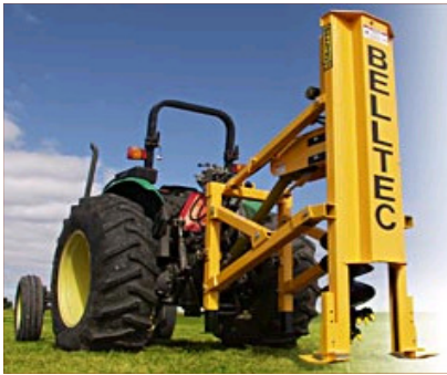
TM48 3-Point Drill