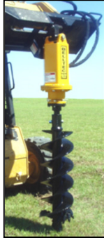
H Series - w/Replaceable Output Shaft