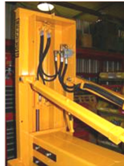
Up to 4500# Downpressure