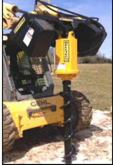
QT1400 Weighted Hitch