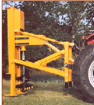
Rail Guided Drilling