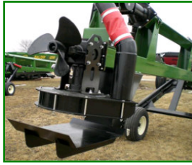
V-6 Dairy Impeller