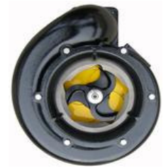
Super 150 Impeller