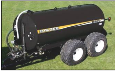
6500 Gal Tandem