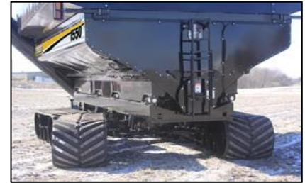
Steering Track Option