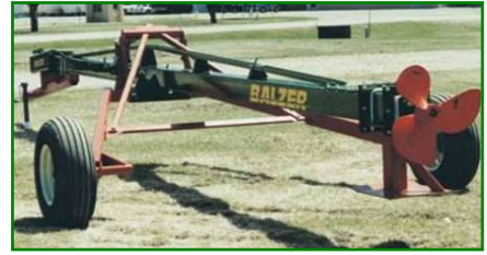
Trailed Prop Agitator