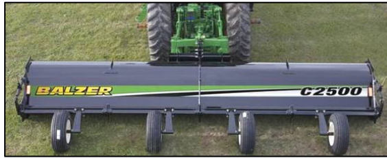
Center Drive Shredder