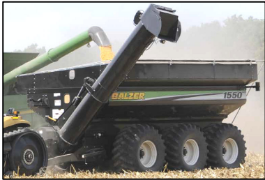
1550 Tridem Cart