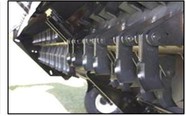
Side Cut Knife Option