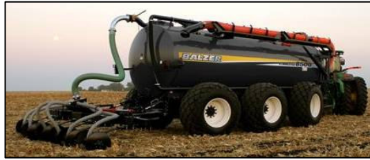
"Eliminator" Boom Tank + Injectors