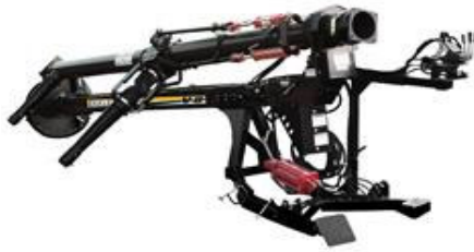
Dairy V-8 PTO Pump