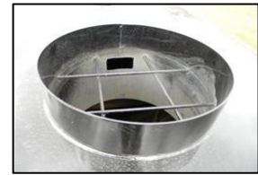
30" Top Fill Port

All tanks have independent running gear, independent axles, hydraulic suspension, 4-blade 15" impeller, 6" brass hydro/pneumatic valve, 30" top fill port, sump w/drain, 1/4" steel tank, auto-steering w/lock-out, 2-wheel hydr brakes w/spring return, safety chain, 2 1/4" Bull Pull hitch, LED light kit