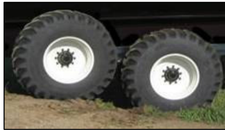
Independent Axles, Full 14" Travel