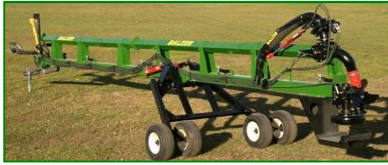
Magnum 43' Pump + Veneroni Impeller