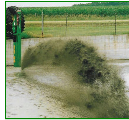
V-6 Pump Agitation