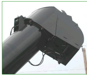
Hydr 2-Way Spout Control