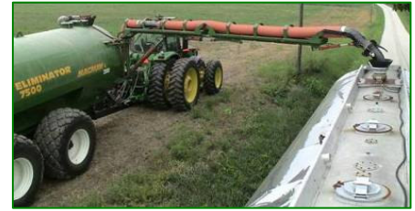
"Eliminator" Boom Loading from Semi