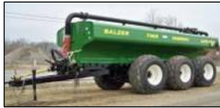
Low-Profile Narrow Tank