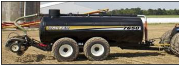
7650 Round Tank + Injector