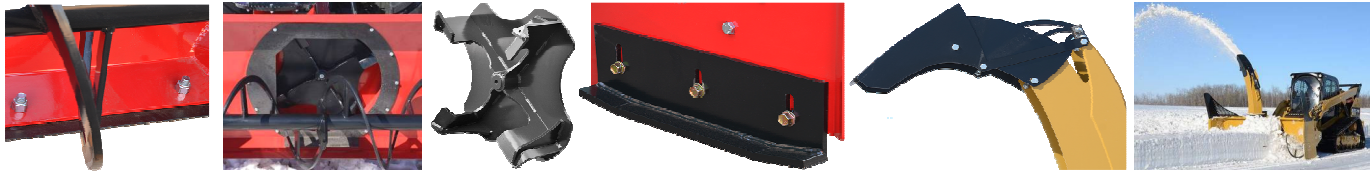
Reversible edge Jet Stream fan shroud 4-Blade fan Adjustable skid shoes 2-Joint high/low deflector Skid steer models

Aug 19, 2016 FOB Logan UT Free delivery to stocking locations.