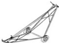
HST-10T + tires