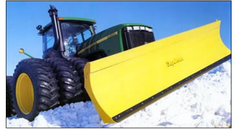
Model 7200, Hydr Angle & Tilt