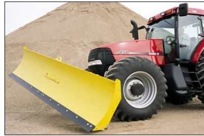
Model 5900 Dozer