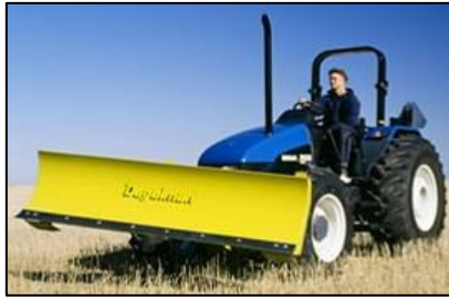
Model 3500 Dozer

Ellis Equipment is your Degelman sales rep, not a distributor. Dealers will be invoiced by Degelman.