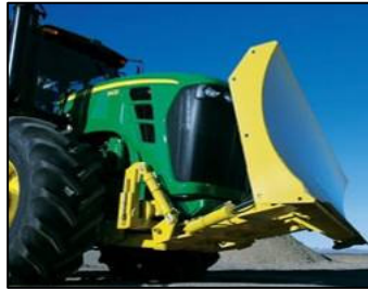
Model 6900, Hydr Angle