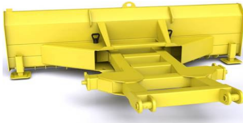
Model 6600, Manual Angle

Ellis Equipment is your Degelman sales rep, not a distributor. Dealers will be invoiced by Degelman.