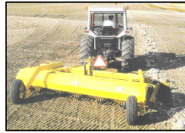
RR1500 Rock Rake