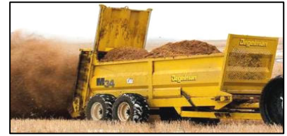
M34 Manure Spreader