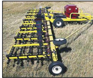
Strawmaster Heavy Harrow