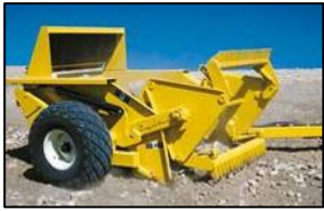
7200HD Rock Picker

Ellis Equipment is your Degelman sales rep, not a distributor. Dealers will be invoiced by Degelman.