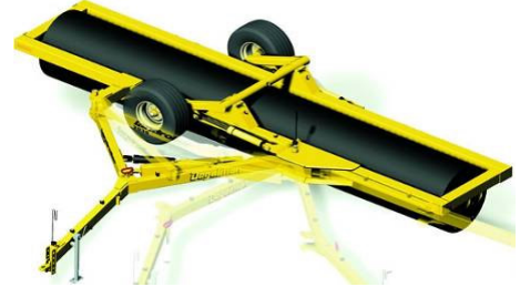
20-Foot Roller w/Pivot Tongue