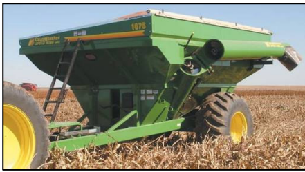
850 Bushel Cart

Ellis Equipment is your Crustbuster sales rep for carts & drills, not a distributor. Dealers will be invoiced by Crustbuster.