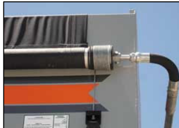
Standard Roll Tarp