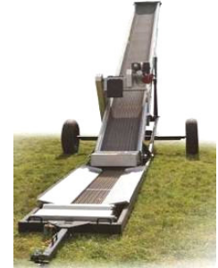
Stainless Field Loader