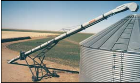
Conveyor + Options