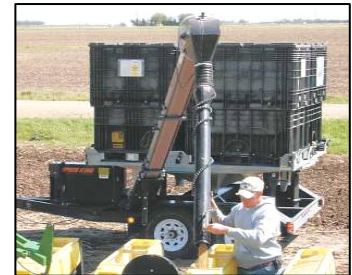
4-Box Tote + Boxes