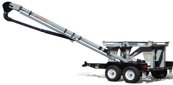
2-Box Tote + Trailer