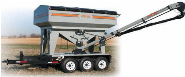
240 Bushel Tender + Trailer