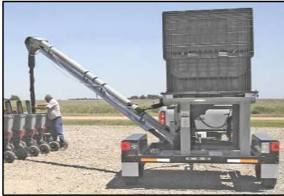
2-Box Tote + Trailer & Boxes