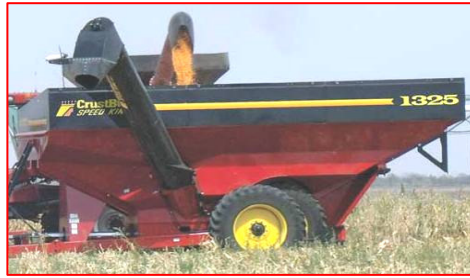
1325 Bushel Cart