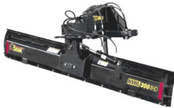
NVHL Blade + Hydraulics