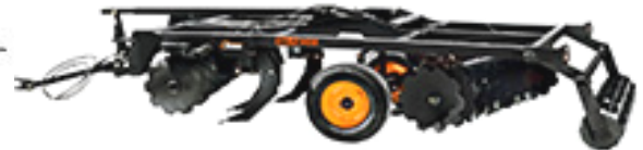
SLC Disc-Ripper-Disc Combo