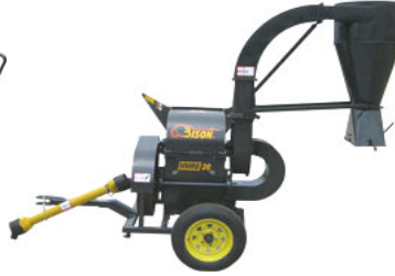
MMRB Feed Mill