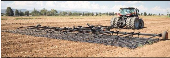
RTP Spike Tooth Harrow Cart