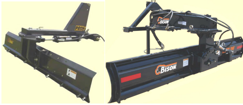
NVHA Blade + Hydr