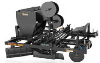
Plastic Mulch Layer + Fertilizer