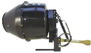
MB Cement Mixer