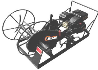
WR Wire Roller