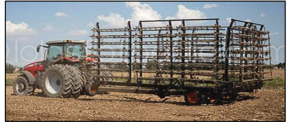
RTP Cart Forward Folding