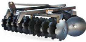
RIB-2022 Offset Disc