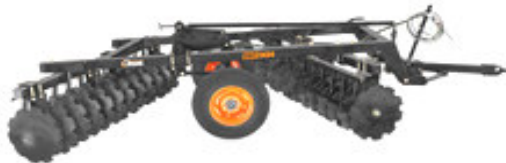
RHT Offset Disc