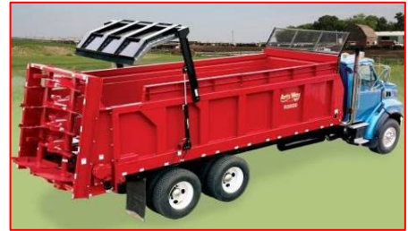
HV220 Truck Mount