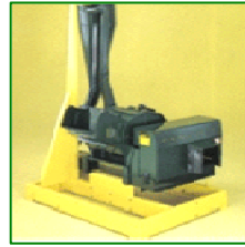
26" Hammer Mill