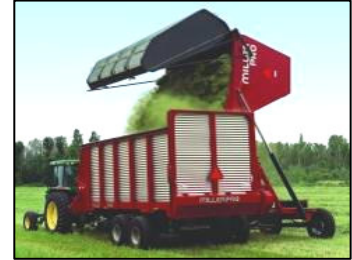
Receiver Box & High Dump Box