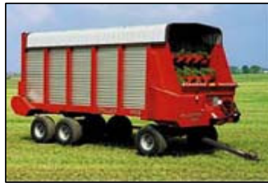
Model 5300 Front Unload + Wagon