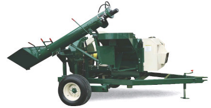
26" Hammer Blower + Feeder