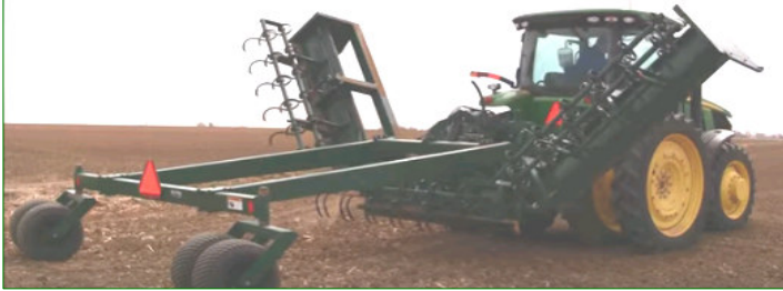
V2400 Land Plane + Dual Wheels + S-Tine