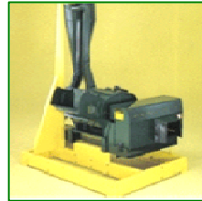
26" Hammer Mill