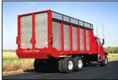
Model 5300 Rear Unload + Truck