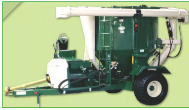
6140 Mixer + Auger Feeder