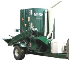
6530 Mixer + Auger Feeder