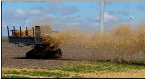
864 Top Spread