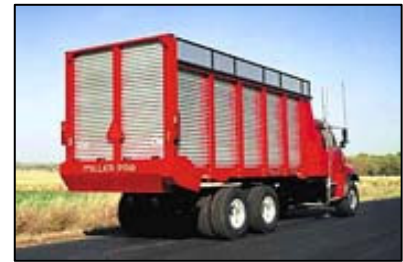
Model 5300 Rear Unload + Truck