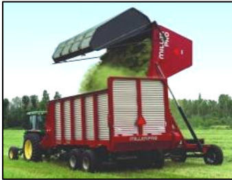
Receiver Box & High Dump Box