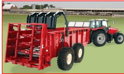
V180 Tandem Axle